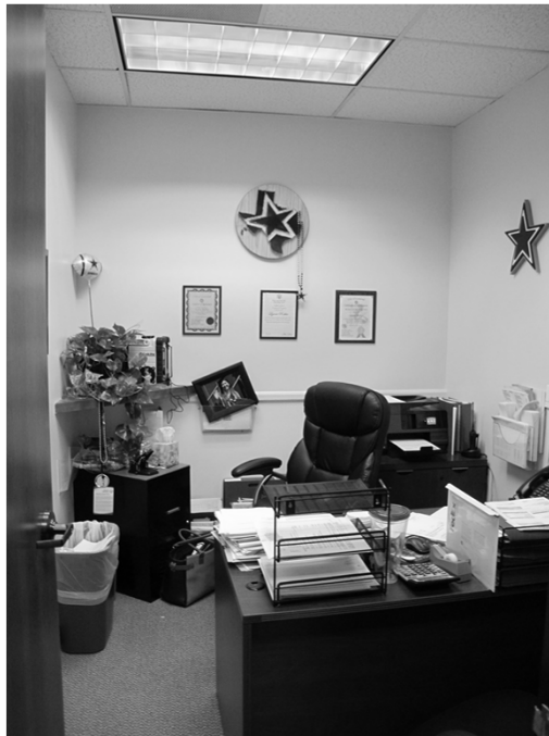
Suite 002 Office 1