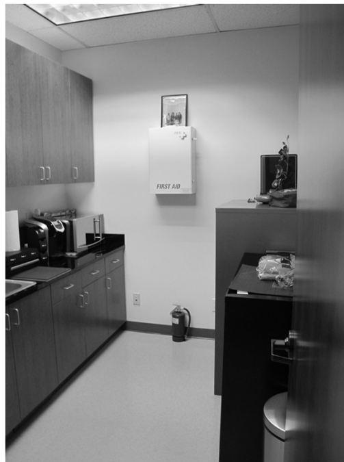
Suite 002 Conference